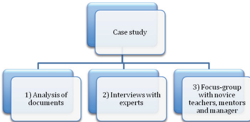
Figure 1. Stages of the case study: Implementation of the induction year for novice teachers in Estonia

2. Interviews with experts. In the following analysis of documents, we conducted a series of interviews with the experts involved in the design, implementation and evaluation of the induction year. The key experts were: the Vice-Rector for Development at Tallinn University and the initiator of the induction programme in Estonia (Expert 1); Head of the Centre for Continuing Education at Tallinn University (Expert 2); member of the Department of Teacher Education at Tallinn University and member of the implementation team working on the induction programme (Expert 3).