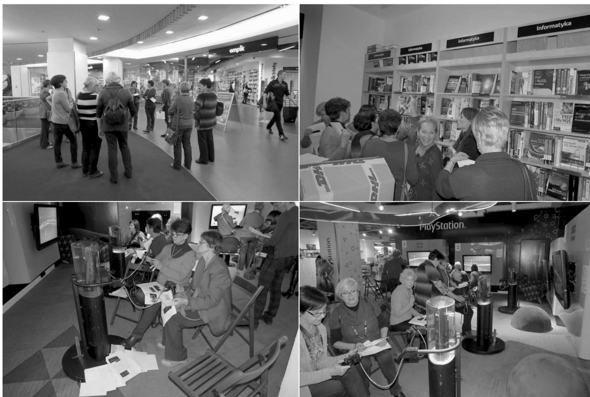
Photographs 1-4. Photographic documentation of the pedagogical experiment in the EMPIK bookstore in Wrocław; November 2013

Verification of the effectiveness of the location-based game method. The next step was the verification of the effectiveness of the location-based game method which was carried out by means of a pedagogical experiment. The experiment was conducted in the multimedia room in the EMPIK bookstore, in the Renoma department store in Wrocław. 57 seniors, students at Universities of the Third Age in Wrocław, took part in it.