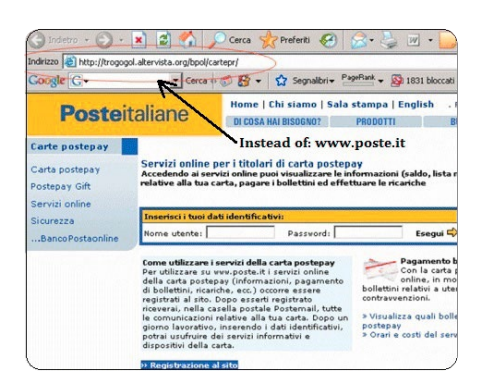
Fig. 6. Example of e-mail phishing.

e) the phisher uses this data to buy goods, transfer money or even as a "bridge" for further attacks (Figure 6).