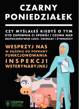
Figure 5. Protest of Veterinary Inspection in June 2019.

(Left) Photo from protest on 14.06.2019.