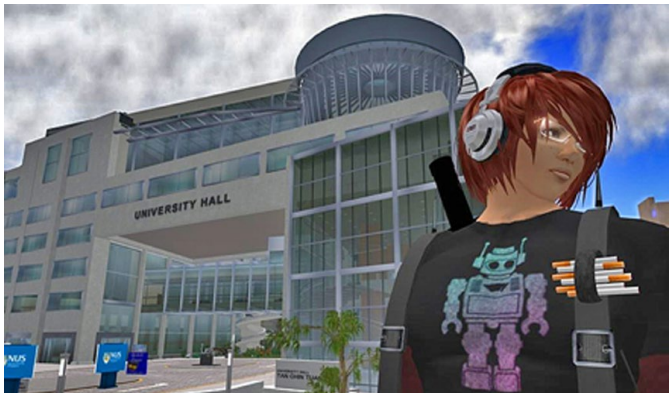
Fig. 3. Main hall of National University of Singapore with one of their students.

Metaverse as such. Some, especially technically oriented schools have their own agenda and purpose for 3D visualisation of objects and mechanisms or testing architecture concepts. But many others, including ours invested money just to "be there", without really acknowledging virtual reality as a new medium and thus subject for media studies and so called "digital humanities".