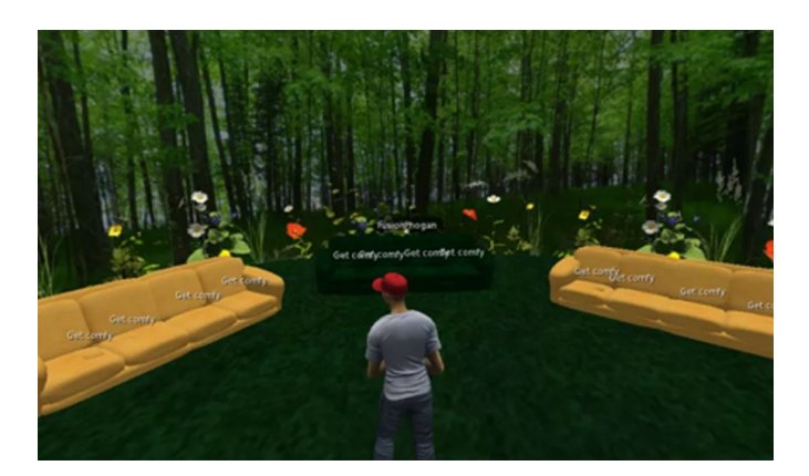
Fig. 2. "Comfy" lecture place with prim texture resembling photorealistic woods.

his examination of what is left from these attempts describes this as "an attempt by education institutions to embrace the weirdness of the web" (Hogan, 2015).